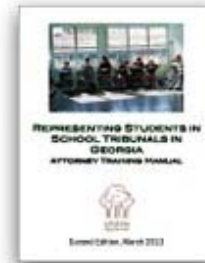
Representing Students in School Tribunals

"Like" Georgia Appleaseed on Facebook today. We're very likable!